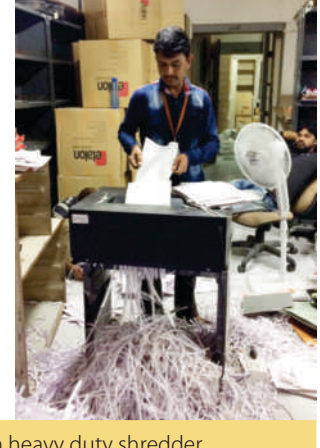
Documents are shredded on heavy duty shredder