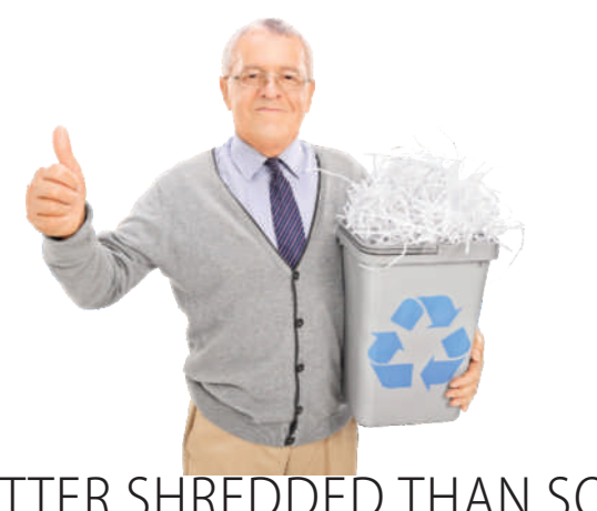
BETTER SHREDDED THAN SORRY

We offer wide range of shredding service plans and packages which can accommodate each and every type of shredding requirements. We can also offer tailor made plan as per client's need. To assist you better, kindly get in touch with us.